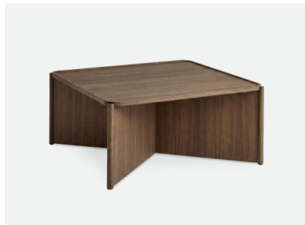
Clings coffee table square light oiled oak or smoked oak finish