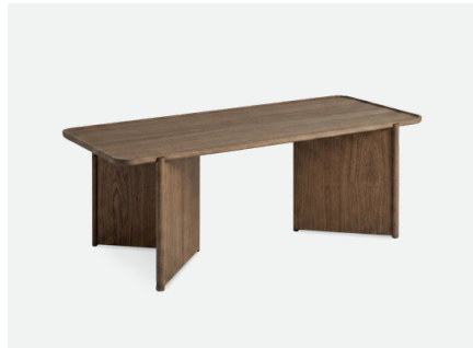
Clings coffee table rectangular light oiled oak or smoked oak finish