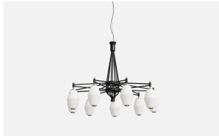
Dahl chandelier small glass black/brass

NOK 36 490 / SEK 36 490 DKK 24 190 / EUR 3 379