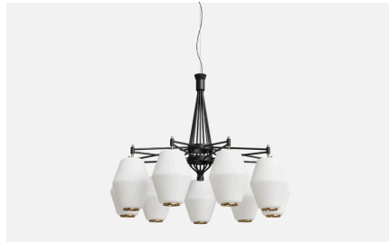
Dahl chandelier large glass black/brass

NOK 53 090 / SEK 53 090 DKK 35 590 / EUR 4 919