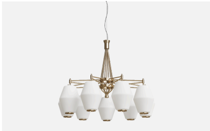
Dahl chandelier large glass brass

NOK 36 490 / SEK 36 490 DKK 24 190 / EUR 3 379