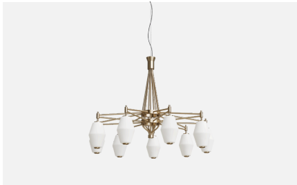
Dahl chandelier small glass brass

NOK 36 490 / SEK 36 490 DKK 24 190 / EUR 3 379